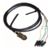
BNC Electrode Cables